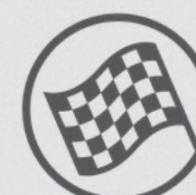
Italian Racing Lycra